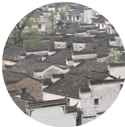
引用中国的屋顶海洋 REFERENCE TO A SEA OF CHINESE ROOFS

The ceiling feature took shape, inspired by the form of a sea of village roofs to sweep and flow through the different spaces, with different heights, lowered at the discussion areas to create intimacy, and soaring upwards to create grandeur for the model gallery.