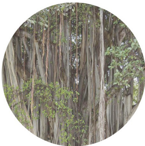
引用榕树 REFERENCE TO BANYAN TREE